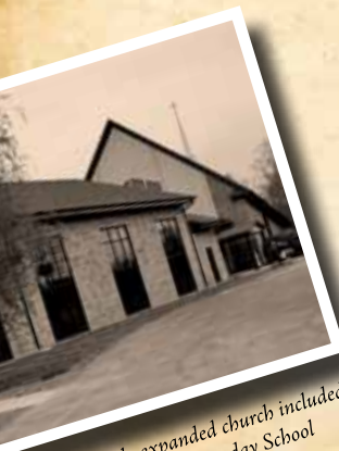
The newly expanded church included a fellowship hall, Sunday School rooms and offices.

Exterior and interior walls were completed.