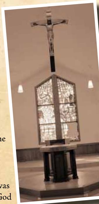
The newly renovated church was dedicated April 14, 2013.

Construction began! God's grace was evident once again as the project moved on schedule with no major issues. Part-way through construction, a group of Resurrection's members decided to fund the seating order in time for dedication.