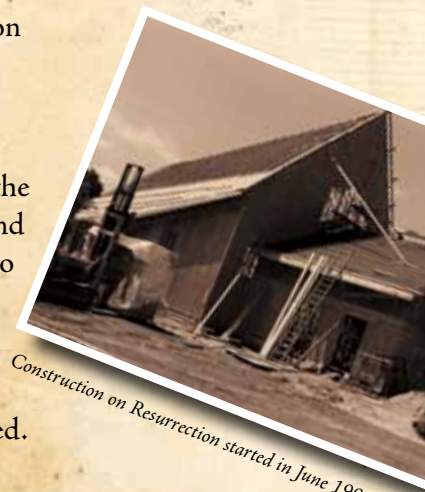
Construction on Resurrection started in June 1991

The first pictorial directory of church members was published.