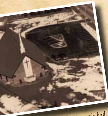
Aerial view of the newly built Resurrection in 1992.