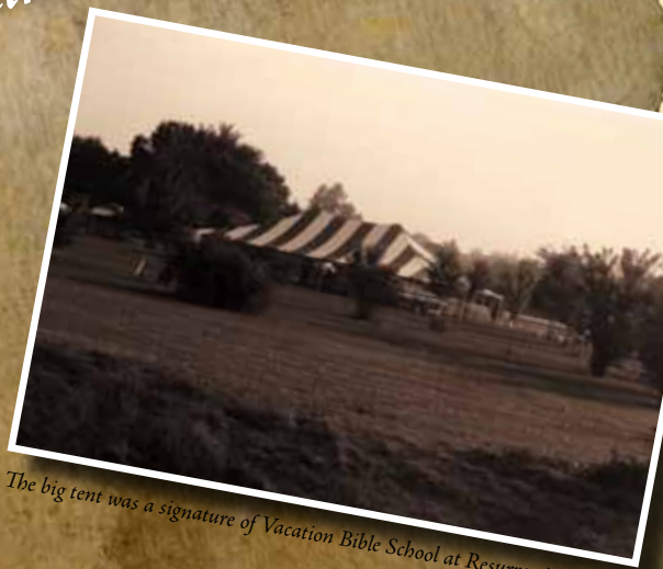
The big tent was a signature of Vacation Bible School at Resurrection.

Luke 18:16,17 Jesus called the children to him and said, "Let the little children come to me, and do not hinder them, for the kingdom of God belongs to such as these. I tell you the kingdom of God like a little child will never enter it."