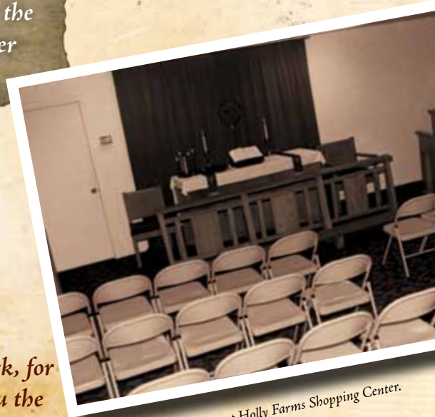
This was the worship area at Holly Farms Shopping Center.

Luke 12:32 Do not be afraid, little flock, for your Father has been pleased to give you the kingdom.